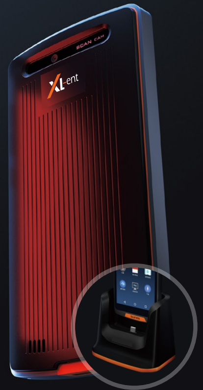
Optional single stand charger